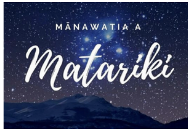
Enjoy the Matariki Holiday on Friday 28th