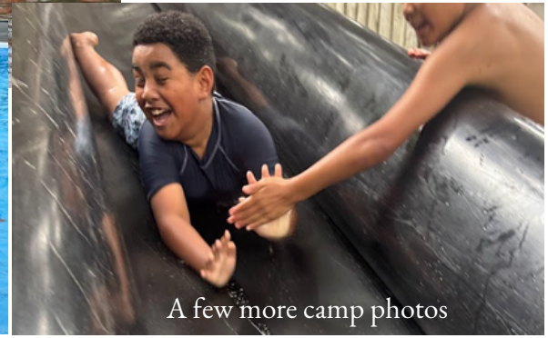
A few more camp photos